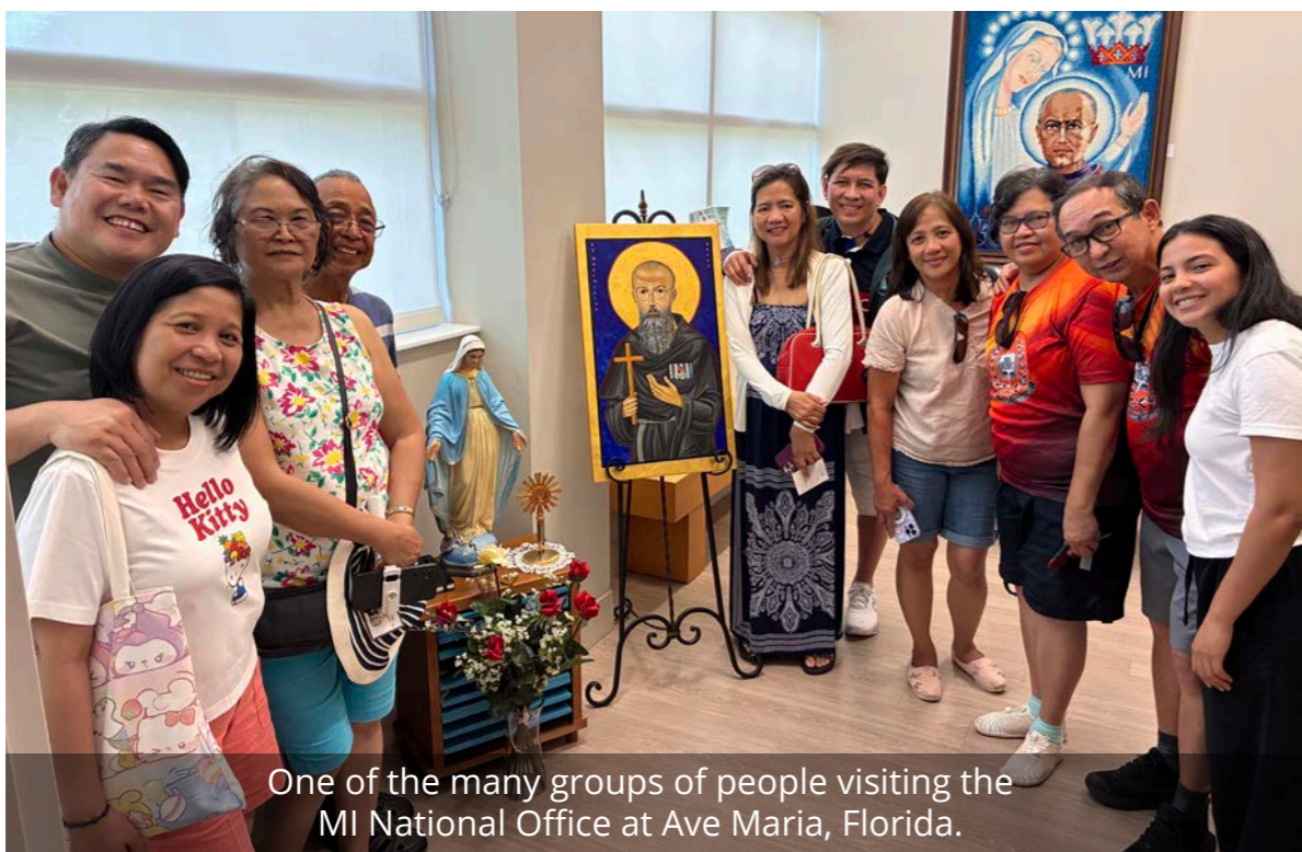
One of the many groups of people visiting the MI National Office at Ave Maria, Florida.