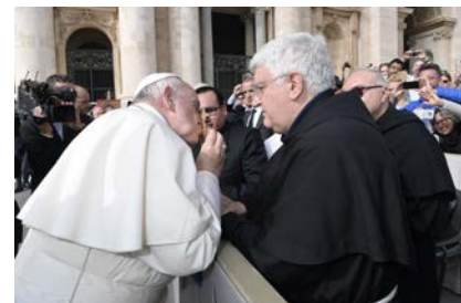
The Pope venerates St. Maximilian’s relic.