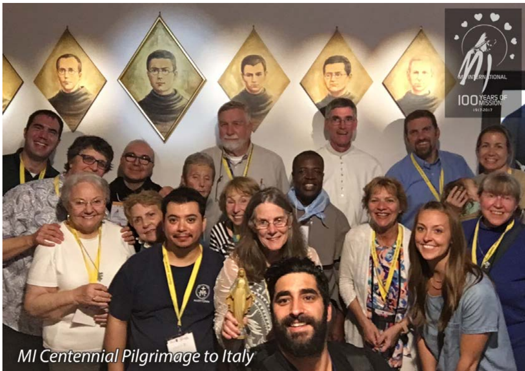
MI Centennial Pilgrimage to Italy

THE MISSION OF THE Immaculata E-PUBLICATION OF THE MILITIA OF THE IMMACULATA, USA