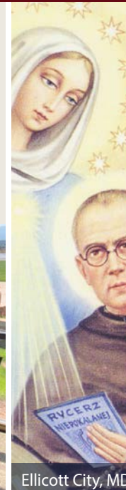
Ellicott City, MD