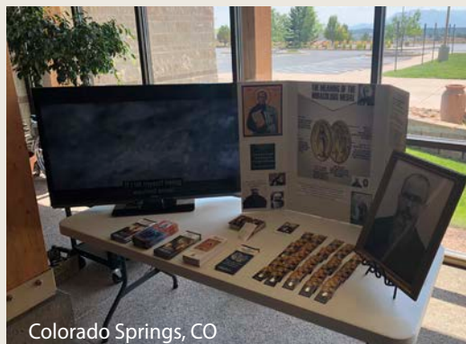
Colorado Springs, CO

nity of the Immaculate Conception. Let us keep in prayer everyone involved in offering the classes and the participants, that all may be totally consecrated to the Immaculata and become generous instruments in her Immaculate hands for the coming of the Kingdom of the Most Sacred Heart in all hearts!