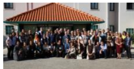
MI International Congress in Fatima

Let us consider these powerful words during this Marian season and be ready to live out our Ideal with heroic dedication!