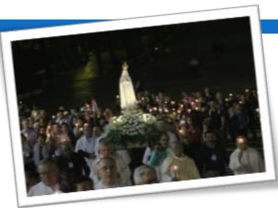
Participants joined the Rosary candlelight procession