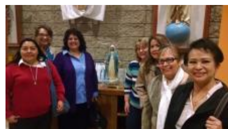
MI News from the West Coast