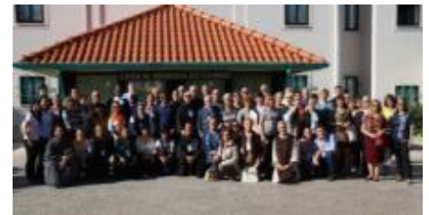
MI International Congress in Fatima Report from National President, Part Two

May the Lord grant us all His Peace throughout this new year of grace.