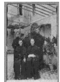
MI Centenary The Beginning of a Great Adventure