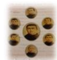
Reflection on January MI Intention