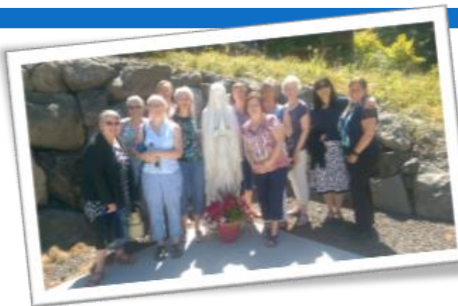
MI Star of the Sea Village, Bremerton, WA

In 2004, our family consecrated itself to Our Lady in the Militia of the Immaculata (MI). The journey to consecration began in 2003 with a visit to the site of the miraculous apparitions at the Rue du Bac in Paris. While there, with my teenage daughters, I prayed wholeheartedly to Our Lady with the intercession of St. Catherine for a "growth in holiness" for our family. As I knelt there, in front of the Saint's incorrupt body, my daughters were pacing the chapel, ready to sprint to our next destination. A Mass was beginning and I remember thinking that we were so blessed and I wanted to stay. Attending one more Mass, not in English, was the last thing my nearly heathen (at the time) daughters had any intention of sitting through; so balancing my own energy to fight yet another battle and finding my resolve weakening, we left the chapel to explore more of the city. But not before I sent a postcard to myself from the holy place. Just recently I found the