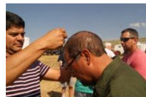
News from around the country New Villages and MI Retreats