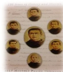
Reflection on March MI Intention