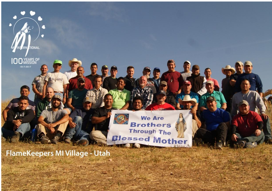
FlameKeepers MI Village - Utah